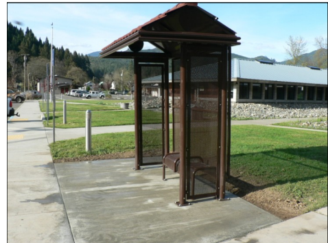
Transit shelter, Happy Camp, Ca

As a member of CalACT, Tribes have access to the CalACT/MBTA Purchasing Cooperative. This Cooperative provides a Federal and California State compliant purchasing solution that allows you to select, not settle for, the vehicle or transit shelters that best meets your transit needs. The Karuk Tribe was able to purchase high quality bus shelters, at a very competitive price point through the Cooperative. The shelters were assembled and installed by Karuk Tribal DOT Maintenance staff and these new shelters are a welcomed addition to the Karuk Tribal communities.